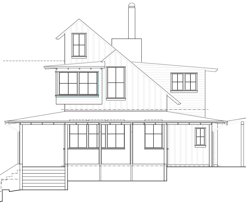
3 ELEVATION - EAST A3.0 SCALE: 1/4" = 1'-0"