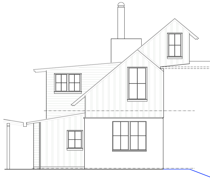
4 ELEVATION - WEST A3.0 SCALE: 1/4" = 1'-0"