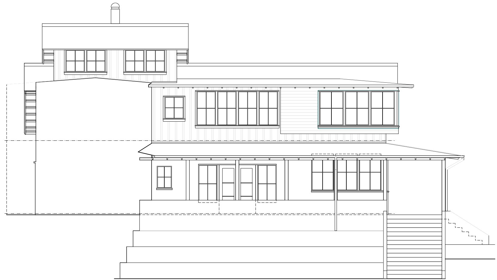
2 ELEVATION - SOUTH A3.0 SCALE: 1/4" = 1'-0"