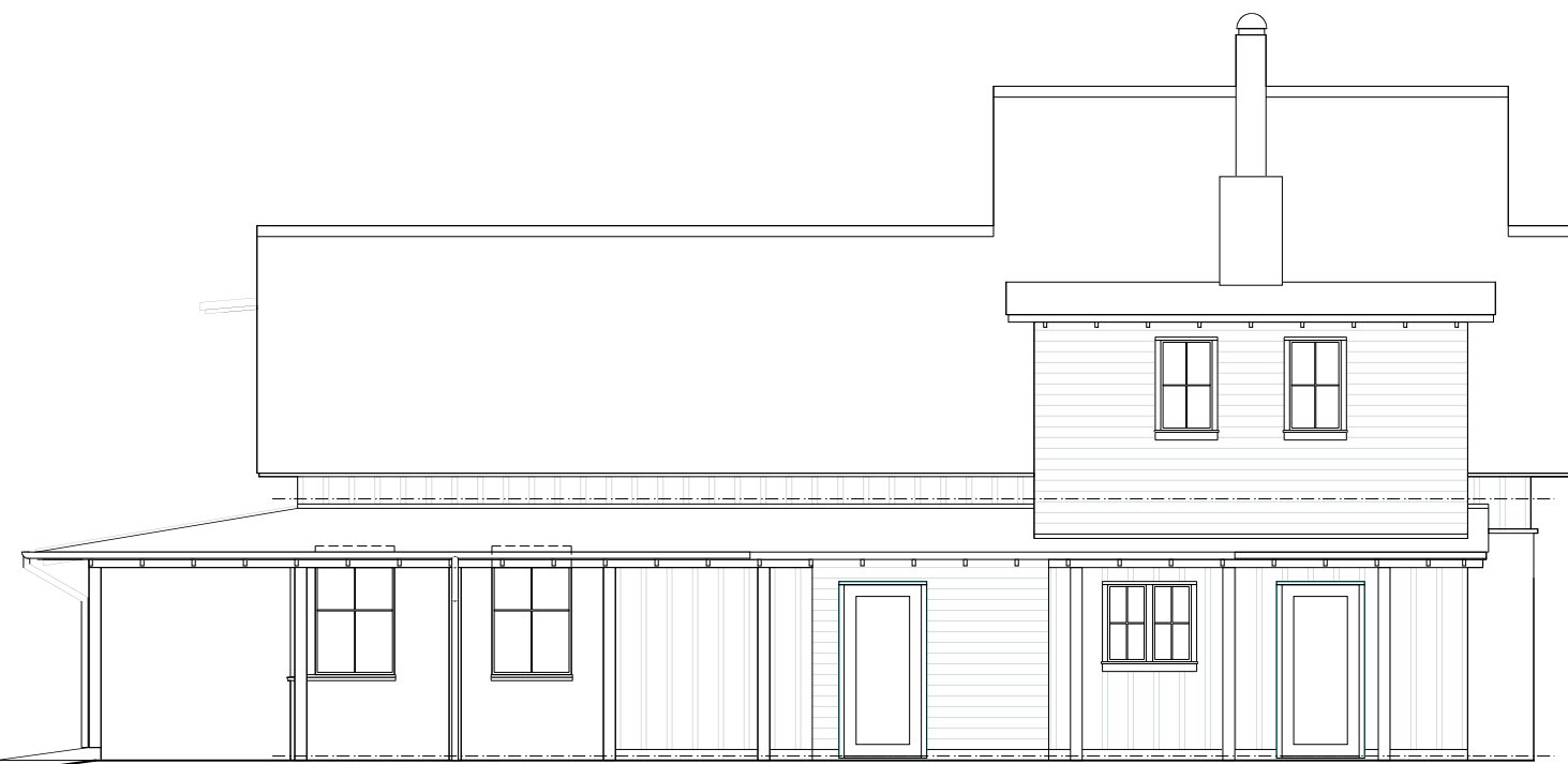
1 ELEVATION - NORTH A3.0 SCALE: 1/4" = 1'-0"